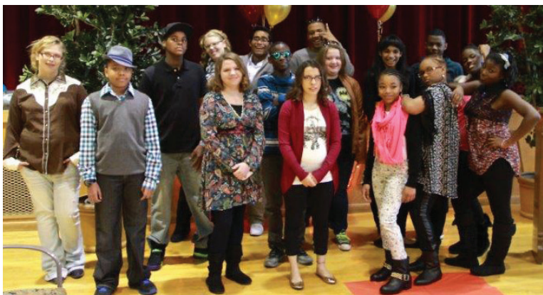
Participating youth show off their fashion star power!